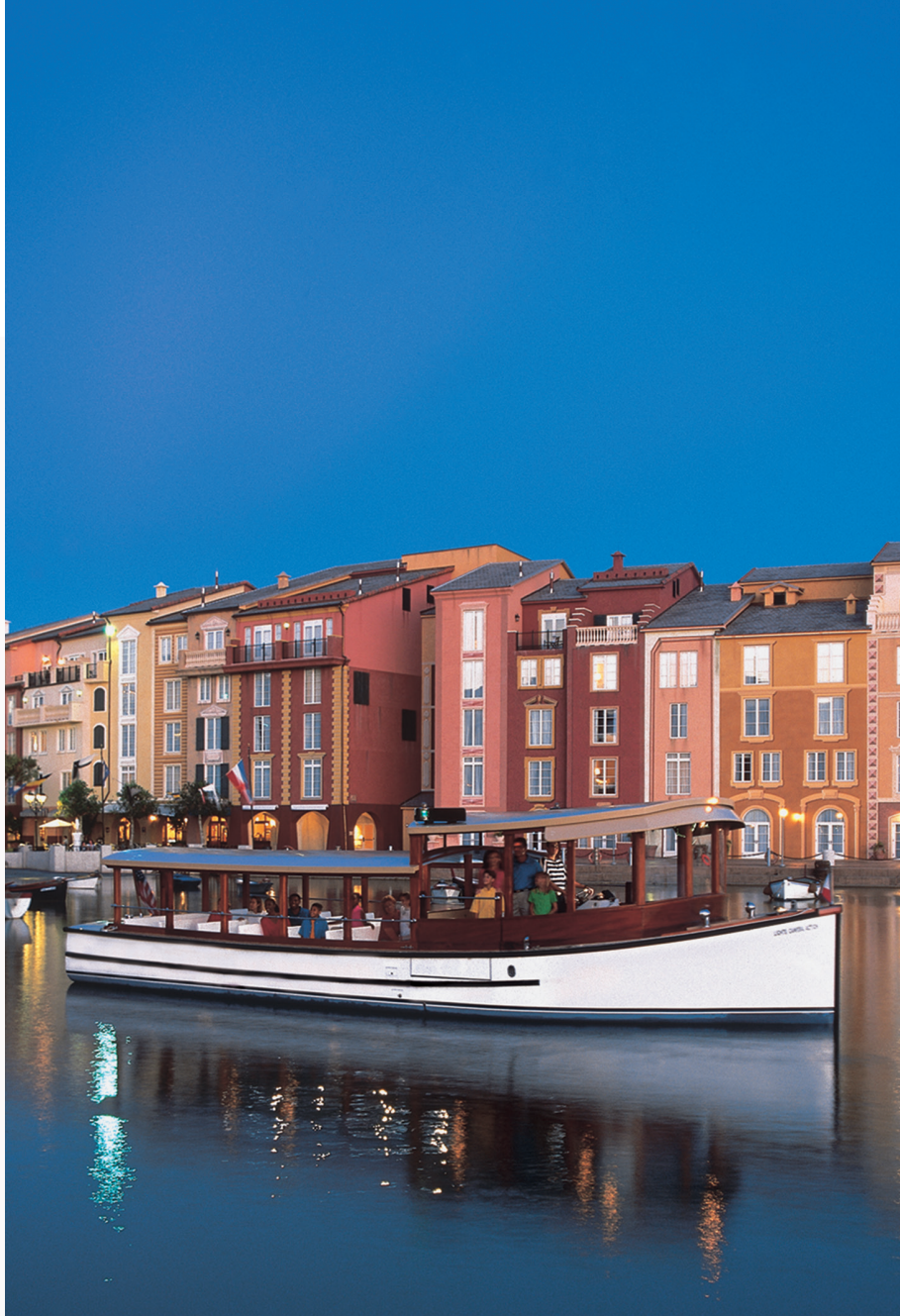
LOEWS PORTOFINO BAY